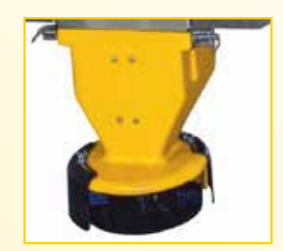
Removable poly chute with poly disc (available on the BL-800 model only).