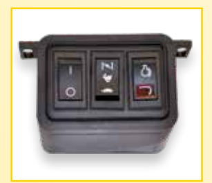
In-cab controller with electric start.