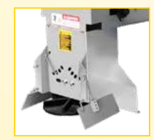
Removable stainless steel chute with standard baffles and poly disc (available on the BL-600 model only).