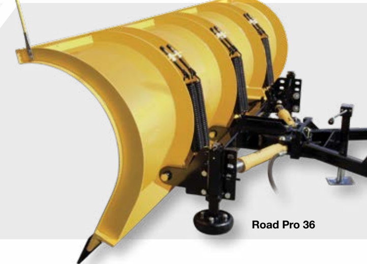
Road Pro 36